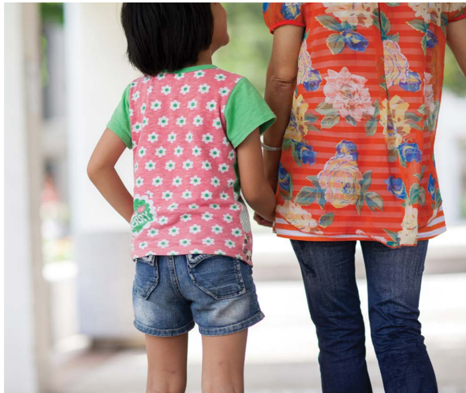
Fostering a child can provide enormous emotional benefits.